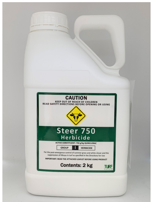
Steer 750 Herbicide