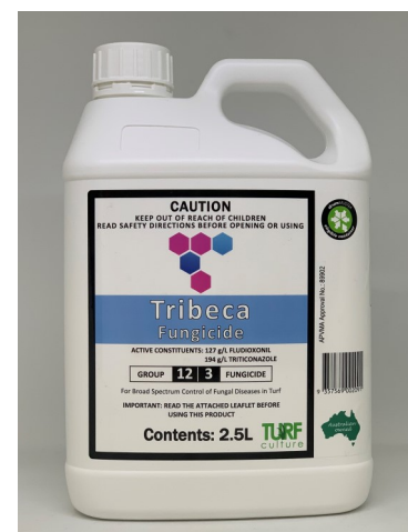
Packaging Pack size: 2.5 L

Root Diseases: Application volumes for root infecting diseases (Brown Patch, Couchgrass Decline, Spring Dead Spot and Take-all Patch) should be as high as possible (approximately 1000 L/ha) to ensure placement close to the soil surface. When lower application volumes are used, washing in should commence as soon as possible after application. Example: For best results use extremely coarse droplets [e.g. Turbo Floodjet (TF5) or TurfJet (TTJ10)] and total application volume of approximately 1000 L/ha. The addition of a soil penetrant is recommended to ensure an even matrix flow through the soil profile. Preferably spray onto wet or dewy grass. Irrigate with 6 to 10 mm of water commencing within 1 hour of application (Note: the sooner Tribeca Fungicide is washed off the leaf and crown and incorporated into the rootzone the better the result).